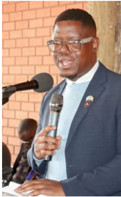
Minister of Local Government and Traditional Affairs Hon. Ketlhalefile Motshegwa officiating at Gamalete Bagaka-Ba-Pele service day