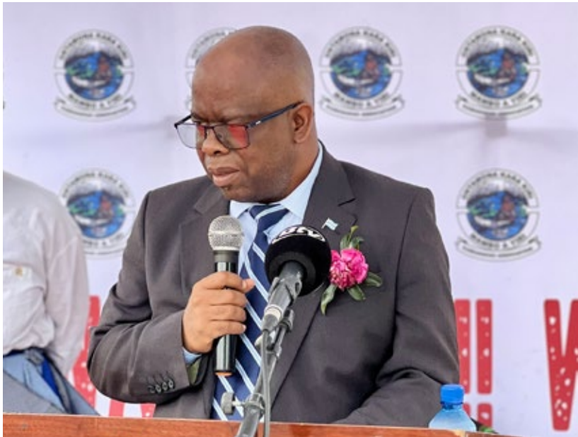
Assistant Minister of Local Government and Traditional Affairs Hon. Ignatious Mokwaledi Moswaane giving a keynote address during the Wayeyi Cultural Festival

The Wayeyi Cultural Festival in Gumare celebrated heritage, unity, and language preservation, blending vibrant performances with official recognition of the Wayeyi people's identity and legacy.