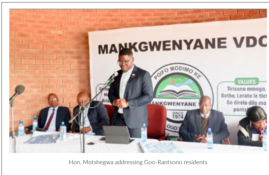
Hon. Motshegwa addressing Goo-Rantsono residents